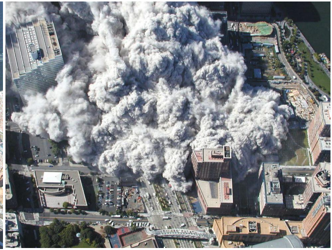
Figure 80.

This is the rollout of the dust cloud from WTC1. The dust on the pavement in front of the cloud shows the dust from WTC2 stopped about one block before the pedestrian bridge. The dust cloud from WTC1 stopped at the pedestrian bridge, about the distance the WTC towers were separated by.