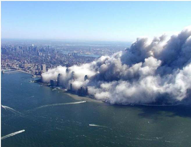
Figure 83. source http://911wtc.freehostia.com/gallery/originalimages/GJS-WTC46.jpg GJS-WTC046.jpg