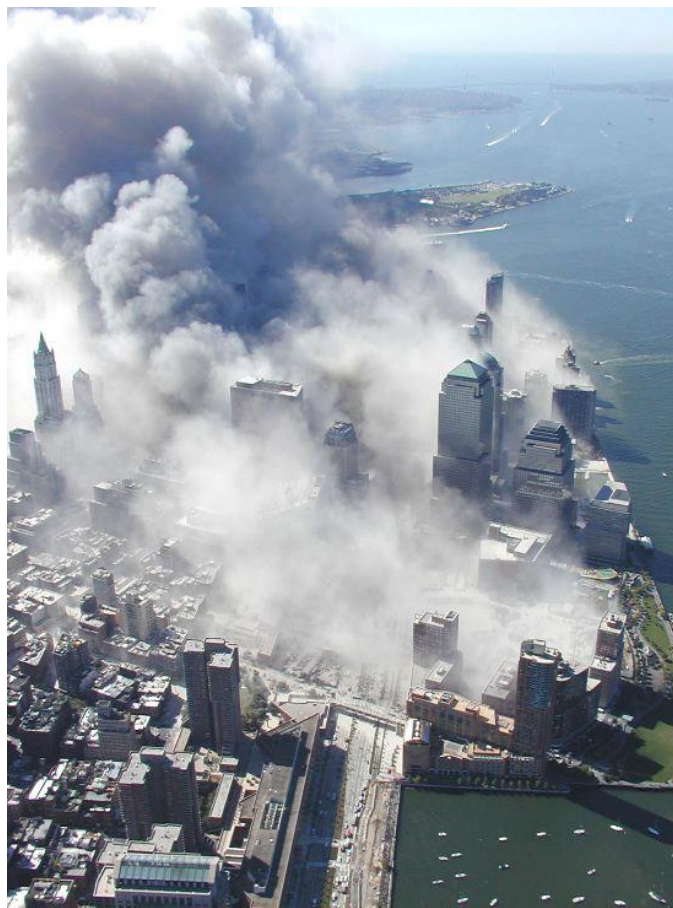
Figure 85.

Yet, dust from the WTC buildings went and stayed up for days.