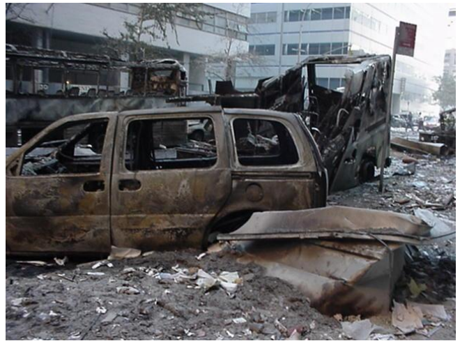
Figure 98. (9/11/01)

Burned out cars and bus along West Broadway. Consistently, they seem to have missing door handles. And the gas tanks don't appear to explode, but several engine blocks appear to disintegrate.