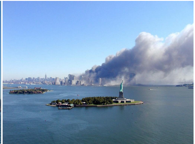
Figure 90. (9/11/01)

This is a ground-level view of the enormous quantity of dust wafting skyward. Conventional demolition dust does not do this.