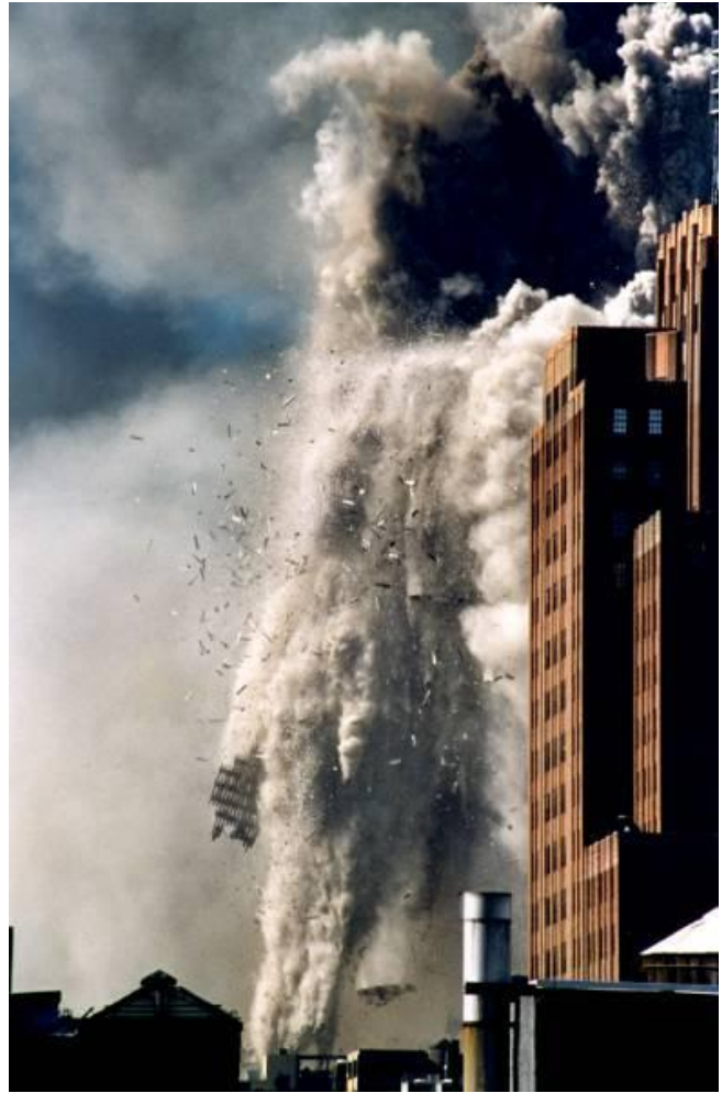
Figure 94. (9/11/01)