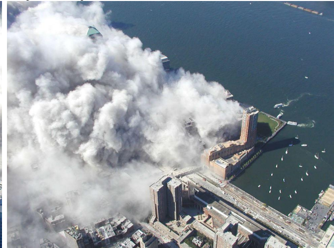
Figure 82.

The dust clouds appear to roll out for a certain distance and then go up.