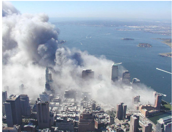
Figure 84.

The dust from blowing up the Kingdom rolled out and settled down in less than 20 minutes.