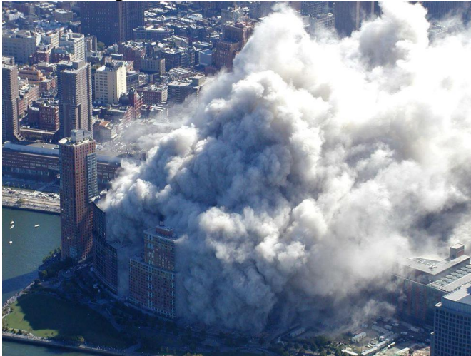
Figure 81. source http://911wtc.freehostia.com/gallery/originalimages/GJS-WTC40.jpg GJS-WTC040.jpg

This is the rollout of the dust cloud from WTC1. The dust on the pavement in front of the cloud shows the dust from WTC2 stopped about one block before the pedestrian bridge. The dust cloud from WTC1 stopped at the pedestrian bridge, about the distance the WTC towers were separated by.