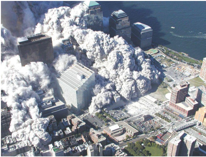
Figure 79. source http://911wtc.freehostia.com/gallery/originalimages/GJS-WTC32.jpg GJS-WTC032.jpg