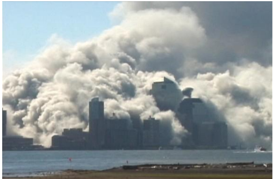
Figure 92. ((9/11/01)

This is a view north, across Pine Street, which is parallel to Liberty Street and a block or two south of Liberty Street. The second photo above shows the destruction of WTC2 enveloping lower Manhattan in a blizzard of ultra-fine dust.