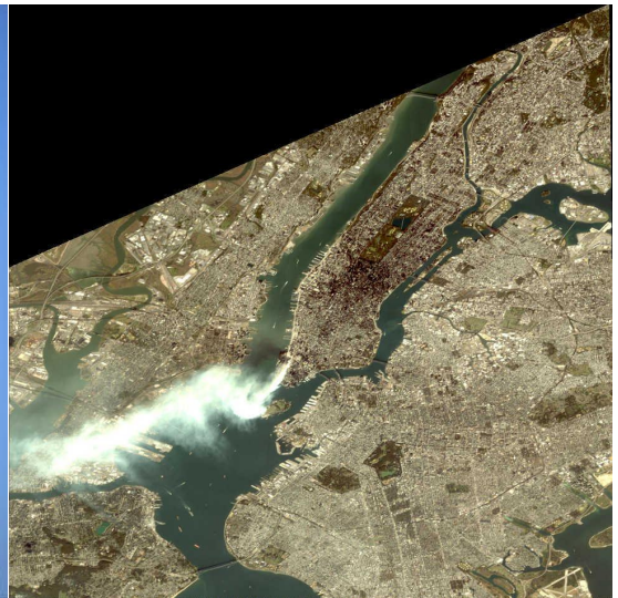
Figure 78. (9/12/01)