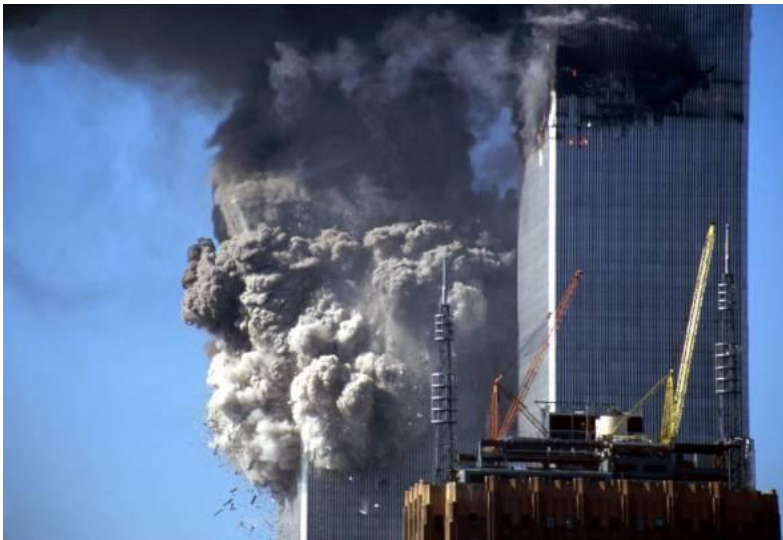
Figure 77. (9/11/01) Source Image252.jpg

Note the two-toned coloration. This does not look normal.