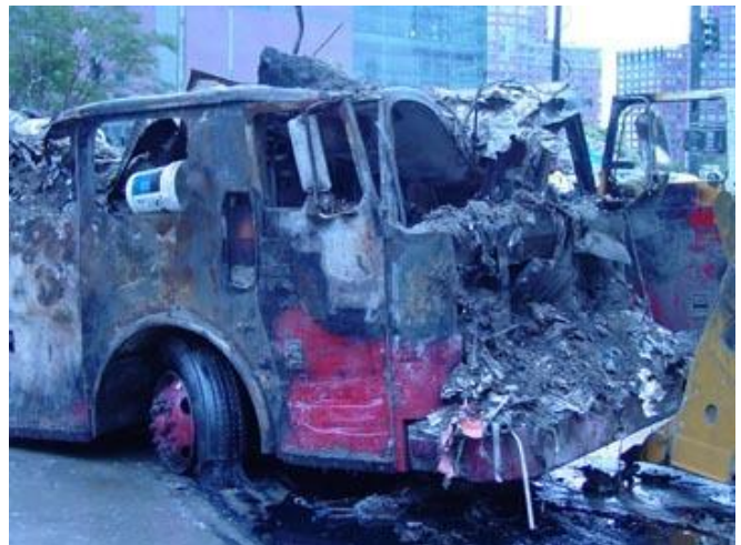
Figure 96.

Peculiar wilting of car doors and deformed window surrounds on FDR Drive.