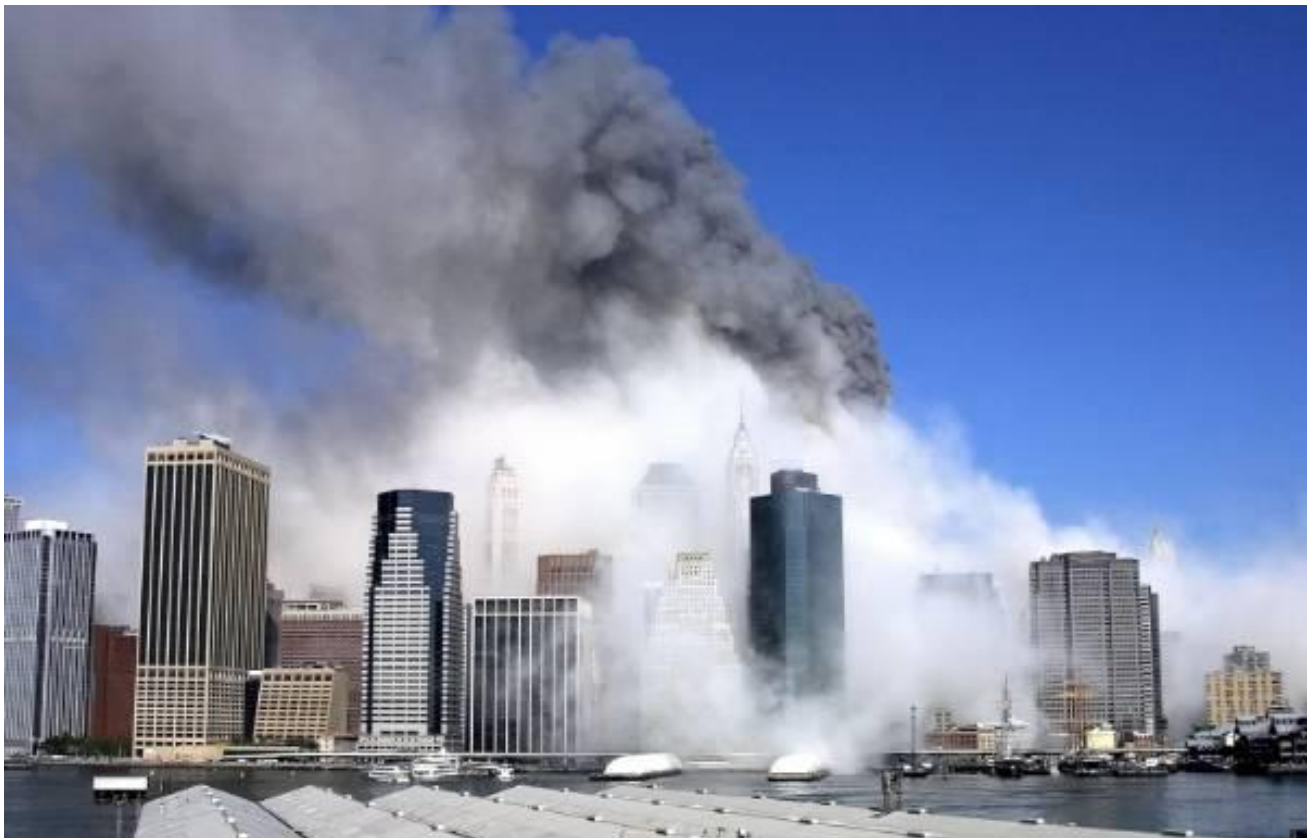
Figure 88. (9/11/01) Source http://hereisnewyork.org/jpegs/photos/5704.jpg 5704.jpg