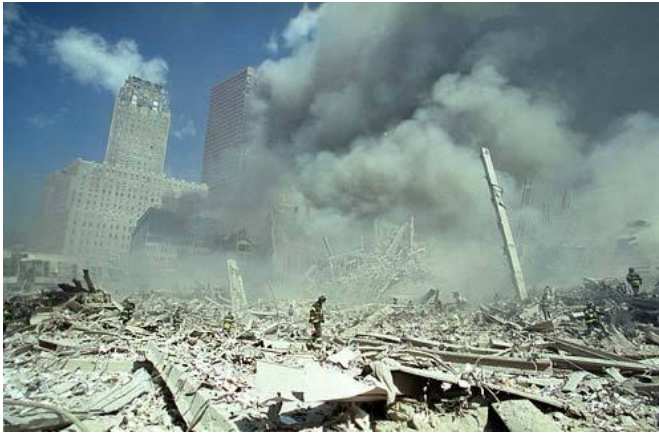
Figure 86. (9/11/01) Source and here search2.jpg

Flat, no rubble pile, fireman at ground level