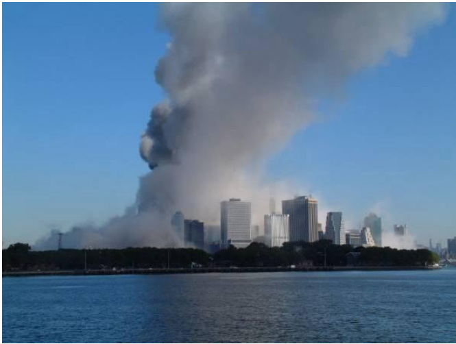
Figure 89. (9/11/01)