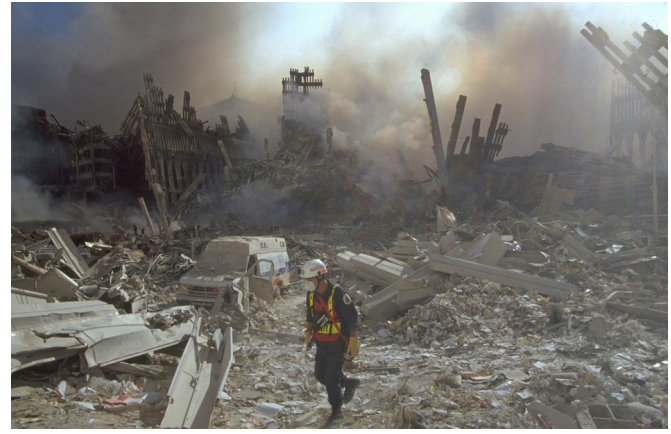
Figure 87. (9/13/01, likely taken on 9/11/01) Source 010913_5316.jpg

WTC6, an 8-story building, towers over the "rubble pile" remaining from WTC1 and 2. We know this photo was take before noon on 9/11/01. WTC7 can be seen in the distance. The Verizon Building is at a distance on the left.