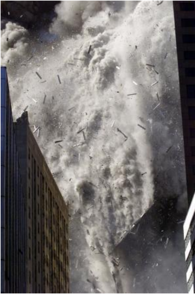
Figure 93. (9/11/01) Source: Shannon Stapleton, Reuters http://upload.wikimedia.org/wikipedia/en/c/c5/DustifiedWTC2.jpg