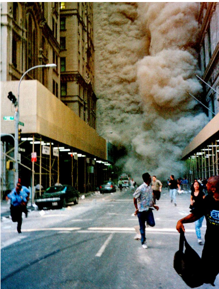
Figure 91. (9/11/01)

This is a ground-level view of the enormous quantity of dust wafting skyward. Conventional demolition dust does not do this.