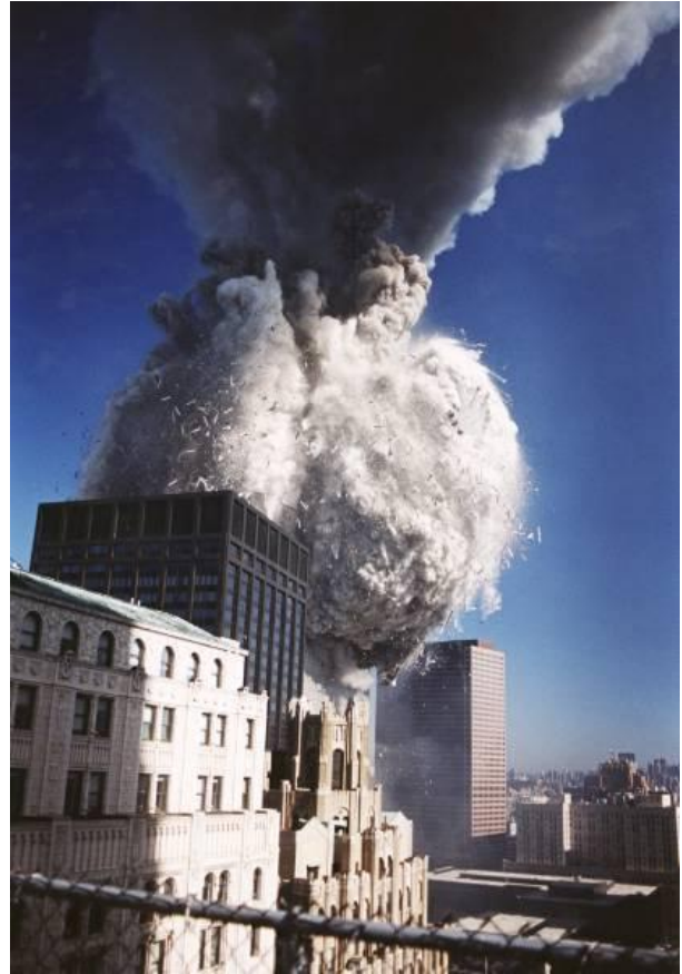
Figure 74. (9/11/01) Source http://hereisnewyork.org//ipe.gs/photos/5245.jpg snowball.jpg