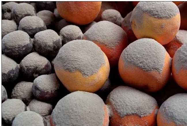
Dust covers an abandoned produce stand in lower Manhattan.