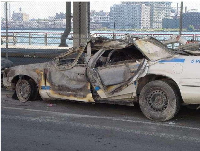
Figure 95.