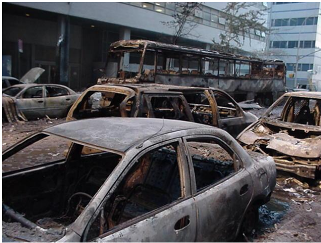
Figure 97. (9/11/01)