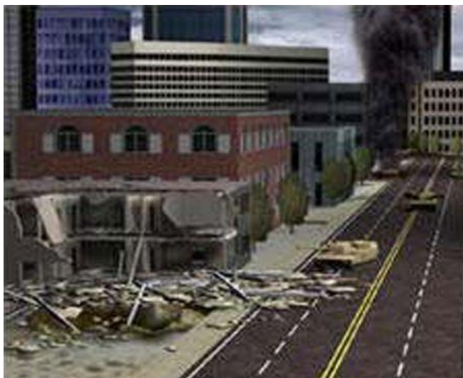
Figure 100(a). source defens1_poof_1.jpg

I think you will agree with me that the following photographic comparison is startling: