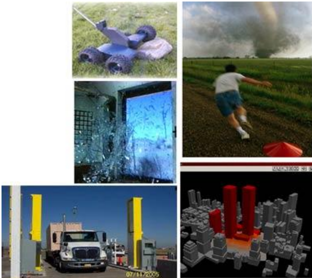
Figure 44. source sec_1.jpg

http://www.ara.com/capabilities/security.htm