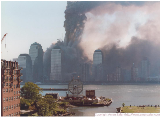
Figure 65. source wtc-71_1_small.jpg