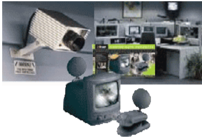
Figure 43. source p_DOT_security.gif

http://www.ara.com/capabilities/p_DOT_security.htm