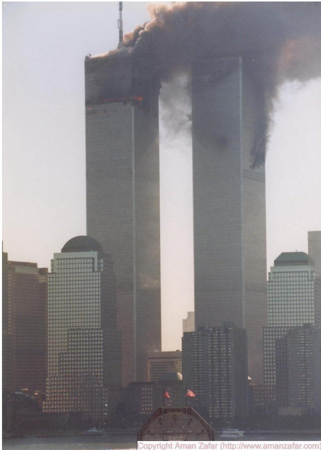
Figure 61. source wtc-31_1_small.jpg