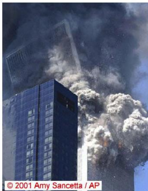
Figure 6–26. Kink on southeast corner near Floor 106 formed after collapse initiation.

Figure 47. Figure 6-26, Document NCSTAR1-6, page 183 (265), http://wtc.nist.gov/NISTNCSTAR1-6.pdf