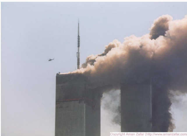
Figure 63.

The second photo above shows another extraordinary phenomenon that NIST and its contractors should have addressed. I refer to this as "silly string." This silly string appears to be emanating from the upper mechanical floor of WTC1.