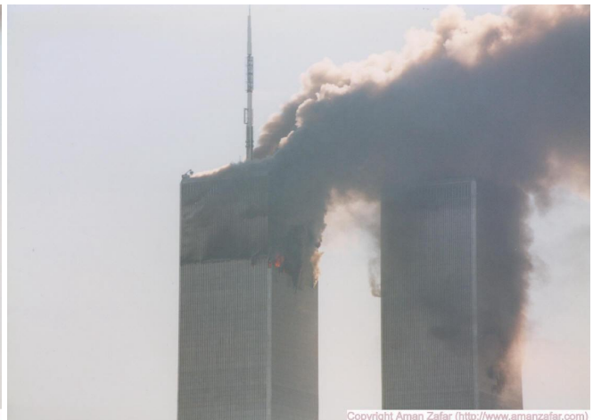
Figure 60. source wtc-22_1_small.jpg