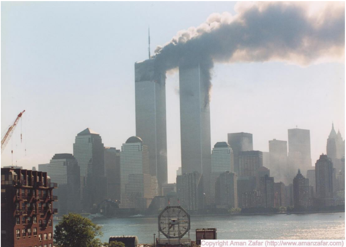
Figure 58. source wtc-16_1_small.jpg