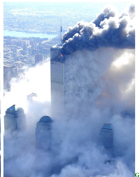
Figure 68.

ARA is contracted by DTRA, among others, to know everything to do with weaponry. As a contractor for NIST, ARA should have been analyzed this phenomenon.