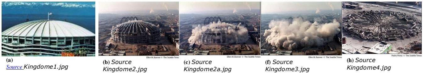
Figure 71. http://drjudywood.com/media/Kingdome_319180.mpg http://portland.indymedia.org/media/media/2005/06/319180.mpg

The Seattle Kingdome is an example of a collapse, imploded by conventional demolition.