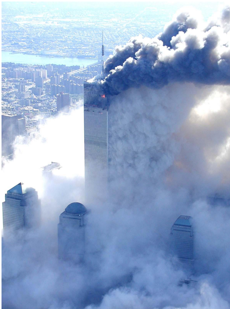
Figure 53.

"Finding 24: The time to collapse initiation was 102 minutes from the aircraft impact (8:46:30 a.m. until 10:28:22 a.m.)"