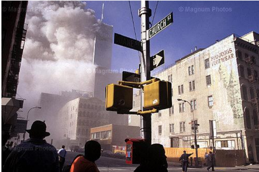
Figure 55.

In the above photo, WTC1 and WTC7 are lathering-up simultaneously.