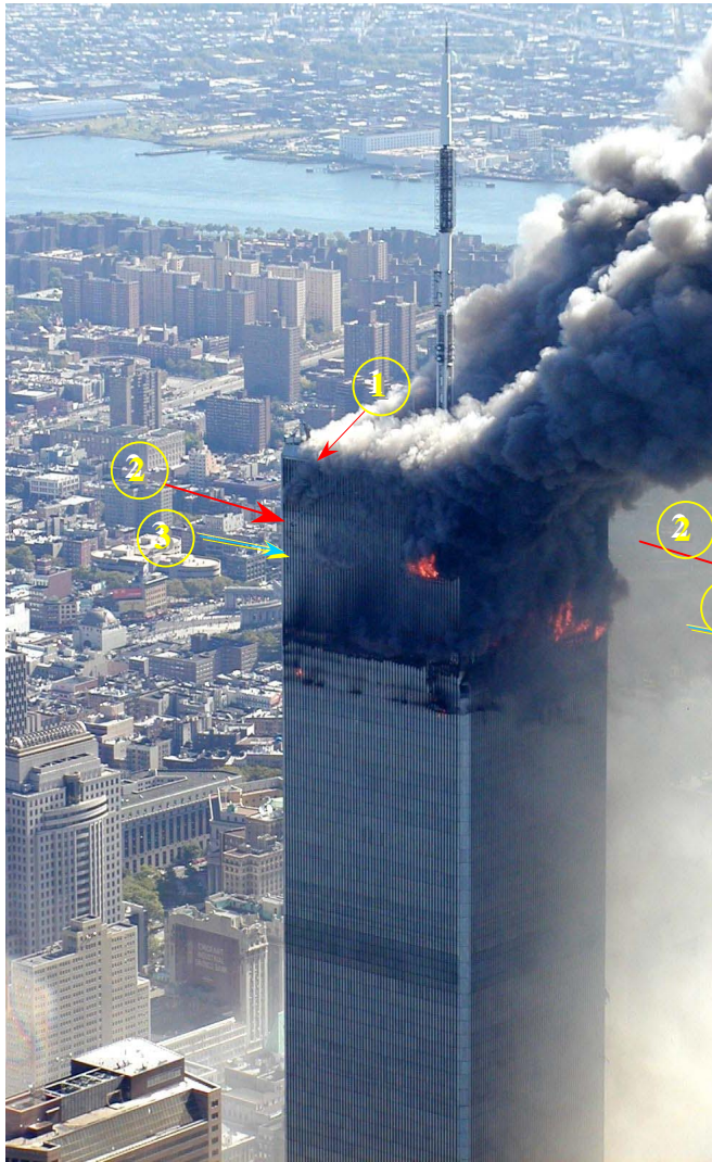
Figure 69. GJS-WTC026.jpg