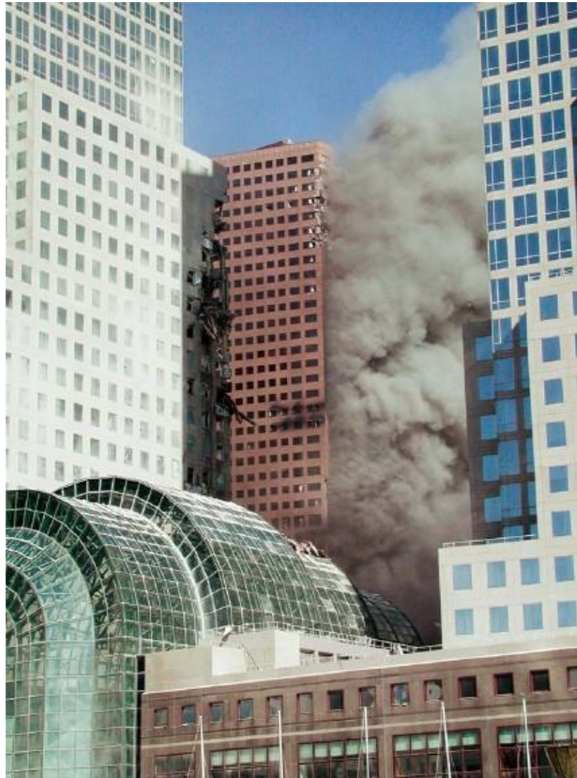
Figure 54. source image001.jpg

WTC1 lathering up shortly after the destruction of WTC2. This is a distinctive phenomenon that weapons experts like ARA would or should know about. This occurred prior to the "initiation of collapse" of WTC1.