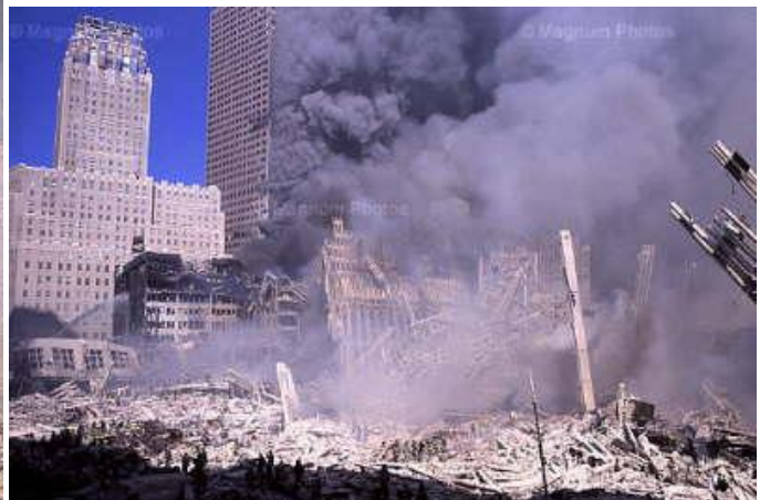
Figure 57.

The WTC7 lathering-up appears much darker in late afternoon, while void of WTC1 fumes in the foreground.