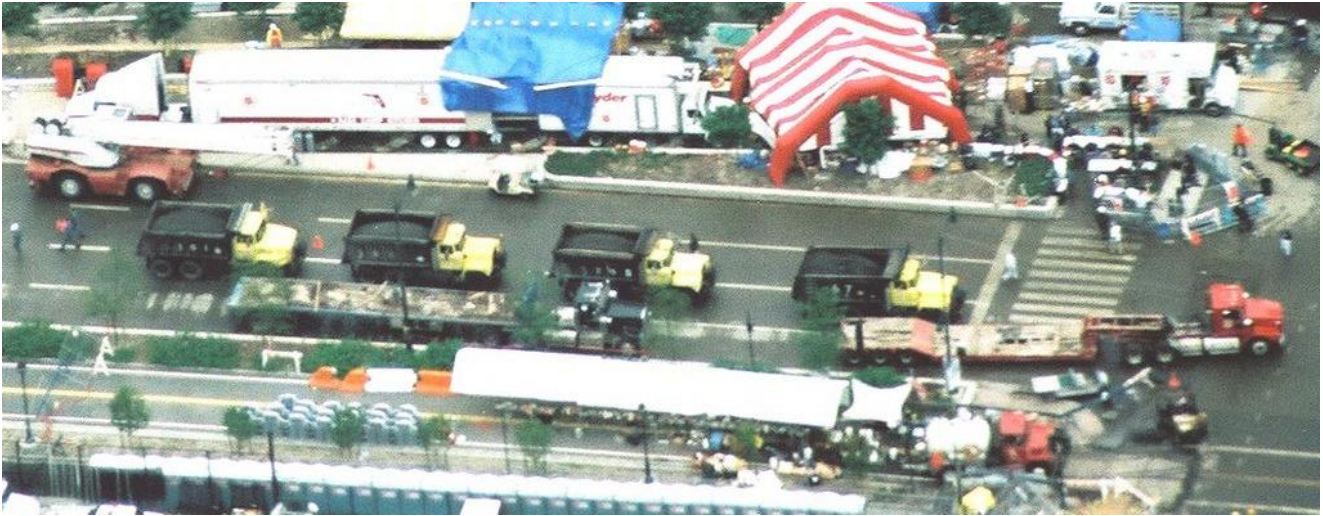
Figure 42. (9/27/01) Source 010927_5644cb.jpg

There is evidence of trucks bringing dirt into lower Manhattan.