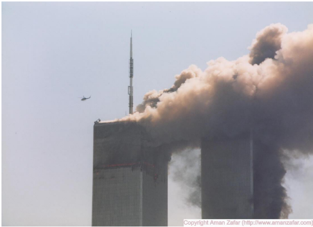
Figure 51. source wtc-39_1_small.jpg