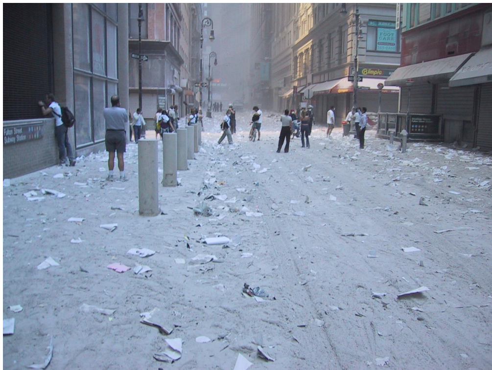
Figure 72.

"Dust choked downtown for nearly 20 minutes, blocking out the sun and leaving a layer of film on cars, streets and storefronts. The dust cloud reached nearly as high as the top of the Bank of America Tower and drifted northwest about 8 miles an hour."