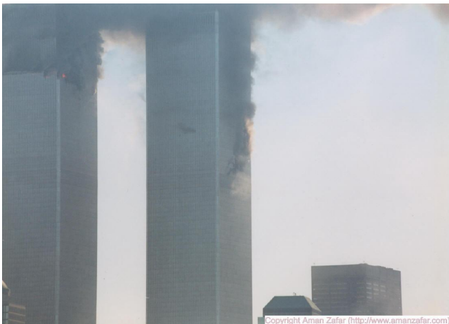
Figure 59.

The figure above shows both WTC towers standing. So, even using the redefined objective, NIST and its contractors should have analyzed the phenomena observed in this photo, such as the fuzzyblob on the south face of WTC1 (at the lower mechanical floor), the furry south wall of WTC2, and especially the fuming of southern Manhattan. Southern Manhattan should not be fuming south of the towers.