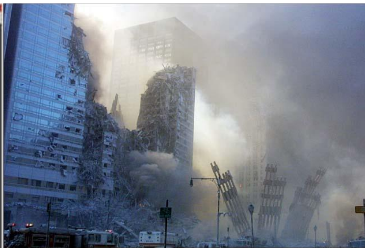
Figure 46.

ARA shows WTC3 too small. WTC3 was a 22-story building, or one fifth (1/5) of the height of the twin towers and nearly half of the height of WTC7. ARA apparently didn't want to remind us just how tall WTC3 was.