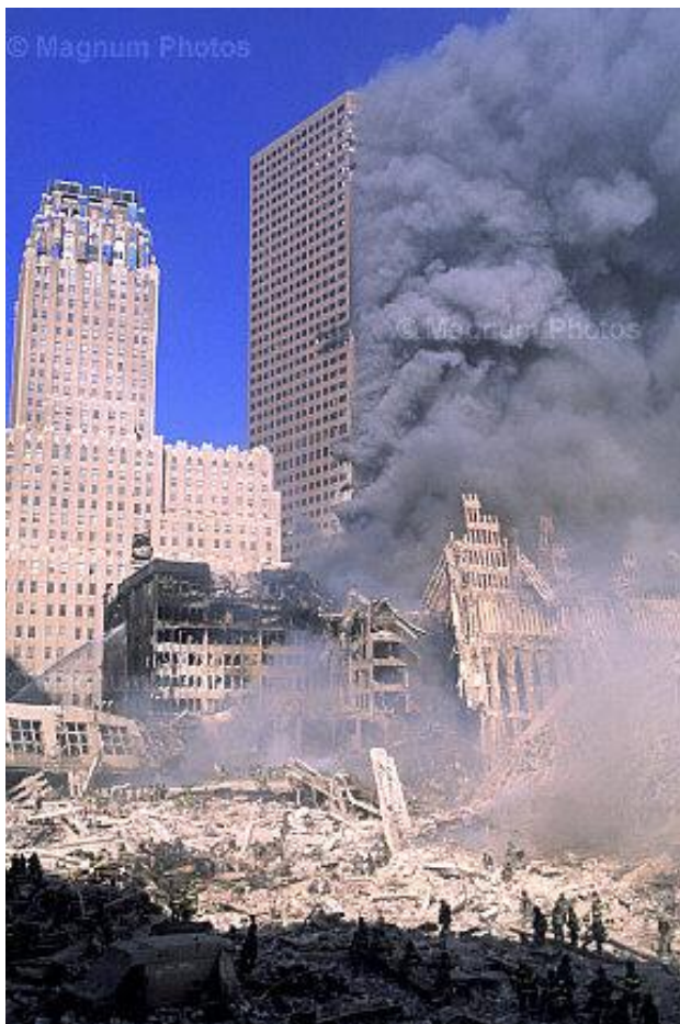
Figure 56.

In the above photo, WTC1 and WTC7 are lathering-up simultaneously.