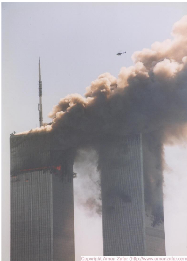
Figure 50. source wtc-34_1_small.jpg

Document NCSTAR1-6, Page lxxv (77), http://wtc.nist.gov/NISTNCSTAR1-6.pdf