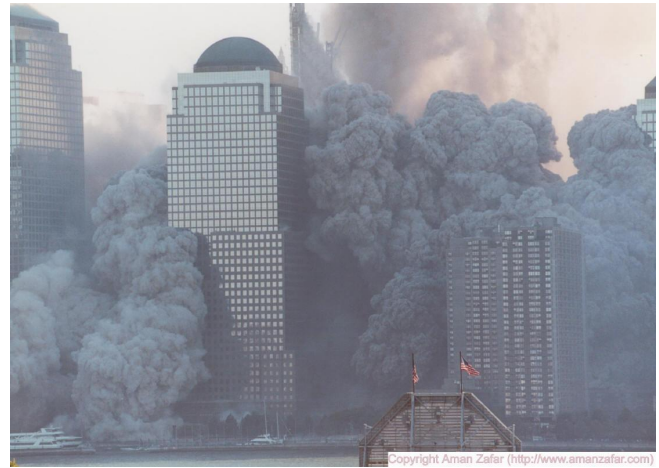
Figure 66.

A collapse does not look like this. The remaining section of the core columns that were not destroyed with the rest of the building, lathered up and turned to dust a few seconds later.