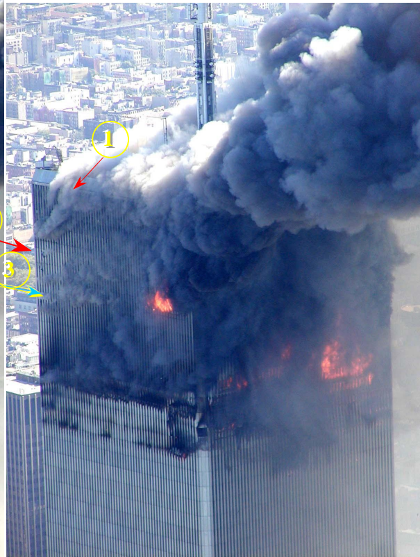
Figure 70.

The two photos above were taken immediately before the destruction of WTC1. There appears to be a person hanging on the exterior of the building, indicated by arrow 2. The second photo shows much more fuming from this person as well as elsewhere. This is inconsistent with high temperatures.