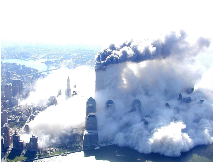
Figure 67.

A collapse does not look like this. The remaining section of the core columns that were not destroyed with the rest of the building, lathered up and turned to dust a few seconds later.