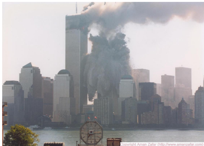
Figure 64.

It is inexcusable for NIST to have surrounded itself with contractors whose primary expertise is lethality effects who then completely leave unanswered the effects discussed in this series of photographs.