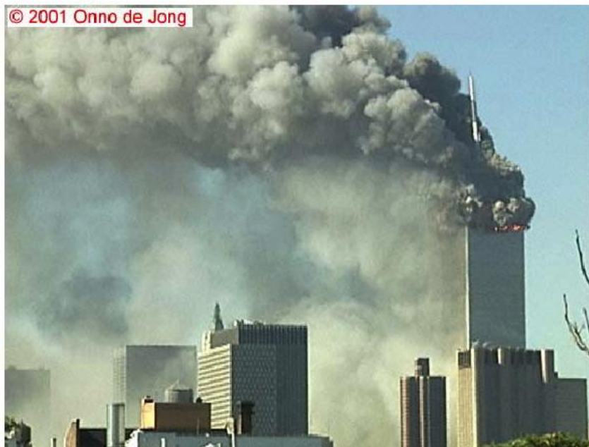
Figure 6–9. Smoke expulsion at Floor 98 from north and east faces at collapse initiation.

Figure 49. Figure 6-9. Smoke expulsion at Floor 98 from north and east faces at collapse initiation Document NCSTAR1-6, page 164 (246), http://wtc.nist.gov/NISTNCSTAR1-6.pdf