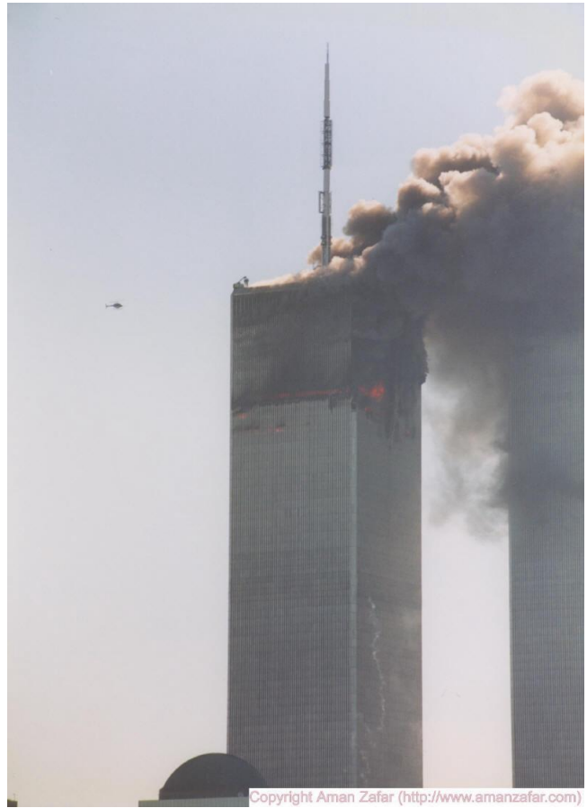
Figure 62. source wtc-32_1_small.jpg

The second photo above shows another extraordinary phenomenon that NIST and its contractors should have addressed. I refer to this as "silly string." This silly string appears to be emanating from the upper mechanical floor of WTC1.