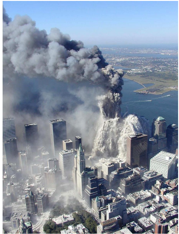
Figure 60. WTC1 from the northeast. Does this look more like a pancake collapse, a volcano, or a dust fountain "bubbler"?