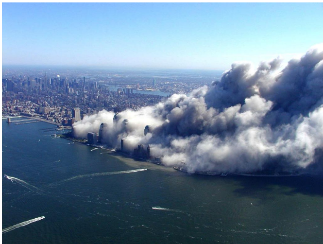
Figure 55. Ultra fine dust drifts skyward.