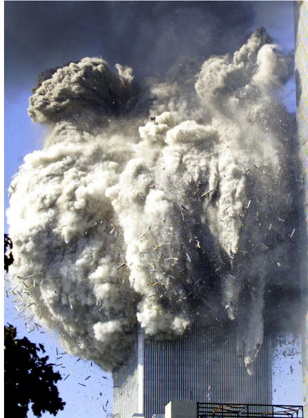
Figure 63. WTC2, demonstrating there is little to no free-fall debris ahead of the "collapse wave."