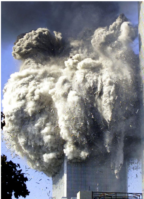
Figure 61. from the north