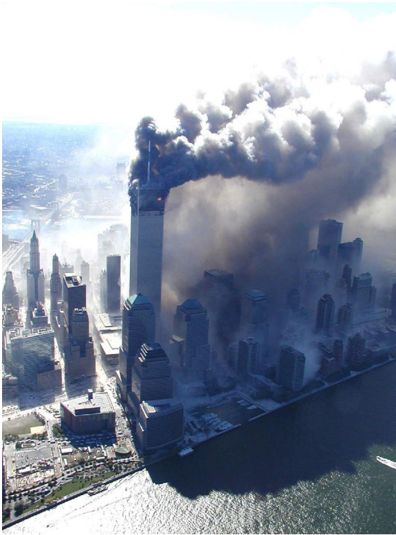
Figure 59. WTC1 smoke obscures WTC 2 destruction. It's like a total eclipse of the sun.