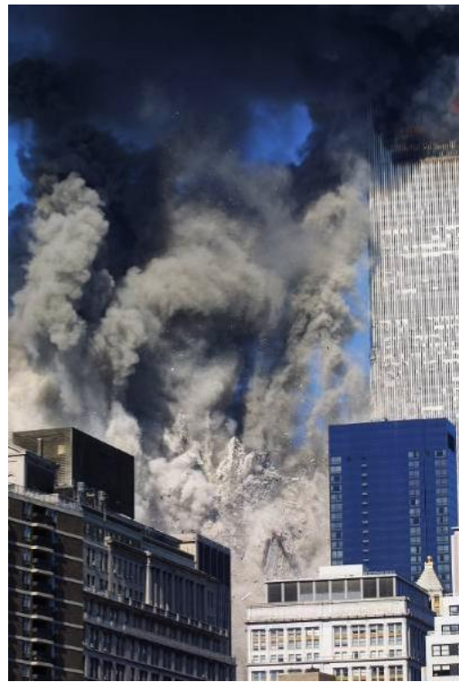
Figure 64. This is not what a collapse looks like