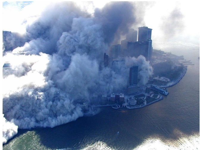
Figure 54. Darkness falls on Battery Park.