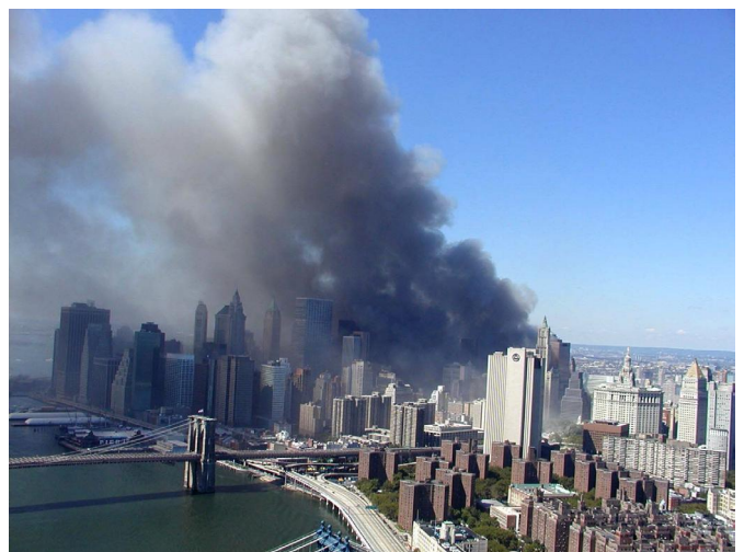
Figure 58. A view south, from down FDR Drive.