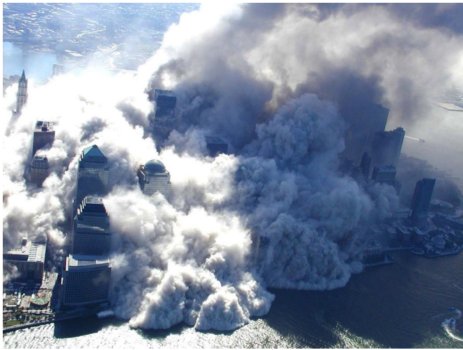
Figure 53. The dense cloud blocks sunlight.