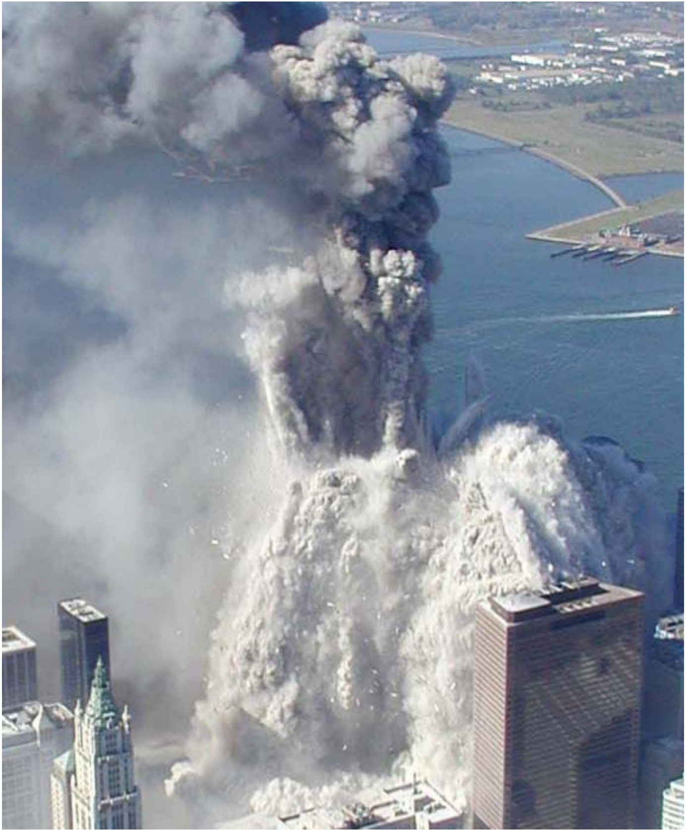
Figure 66. This is not a collapse and it is fraudulent to have so stated. This may be evidence of criminal intent to deceive the public. It is also evidence of the use of DEW. No other explanation fits the depiction of destruction seen above as well as that of use of DEW.