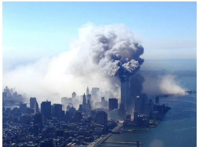
Figure 56. A few south, down the west side.