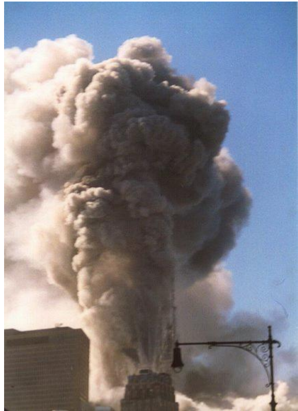
Figure 62. Viewed from the north-northwest