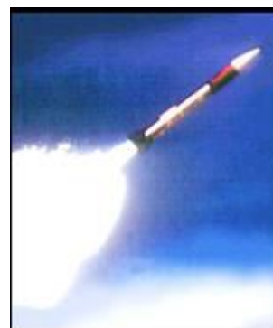
Campaigners say aliens do not like the US missile defence plans

But doesn't he think it will be tricky to walk into the White House and say to George W Bush: "Don't go ahead with missile defence. Aliens don't like it"?